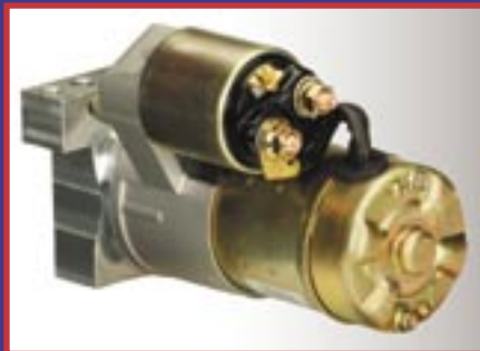
PSL 100 Rear