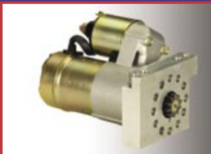
PSL 100 Front